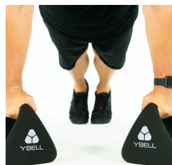
Top Grip = Parallette

Switching YBell grips redistributes weight changing it from one piece of equipment to another.