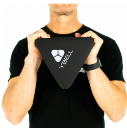
Under Grip = Med Ball