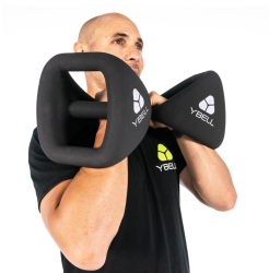
Outer Grip = Kettlebell