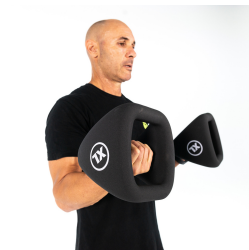
Center Grip = Dumbbell