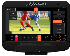
DISCOVER ST CONSOLE