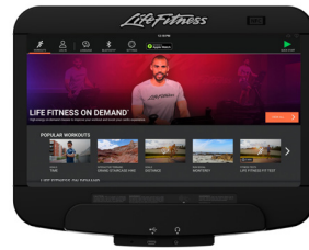
DISCOVER SE3 HD CONSOLE