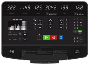
INTEGRITY SL CONSOLE

Console choices include simple, get-on-and-go functionality to more engaging options. Each offers wireless connectivity and insights through Halo.Fitness.