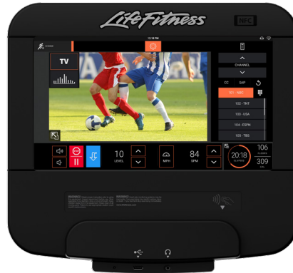
DISCOVER ST CONSOLE