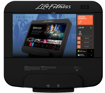
DISCOVER SE3 HD CONSOLE