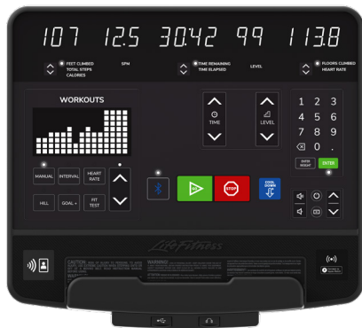
INTEGRITY SL CONSOLE

Console choices include simple, get-on-and-go functionality to more engaging options. Each offers wireless connectivity and insights through Halo.Fitness.