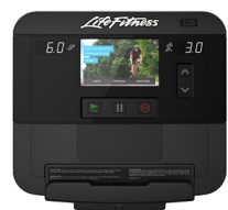
INTEGRITY X CONSOLE