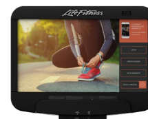
DISCOVER SE3 HD CONSOLE