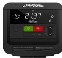
INTEGRITY C CONSOLE (S base only)

Console choices include simple, get-on-and-go functionality to more engaging options. Each offers wireless connectivity and insights through LFconnect.com.