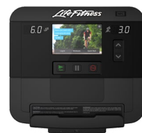
INTEGRITY X CONSOLE