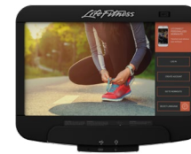
DISCOVER SE3 HD CONSOLE