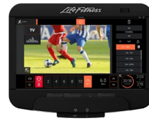
DISCOVER ST CONSOLE