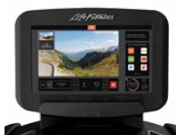
DISCOVER SE3 CONSOLE