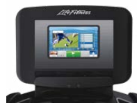
DISCOVER SI CONSOLE