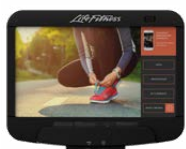
DISCOVER SE3 HD CONSOLE

The Elevation Series includes these console choices: