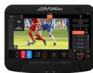
DISCOVER ST CONSOLE