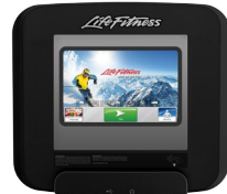
DISCOVER SI CONSOLE