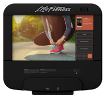
DISCOVER SE3 HD CONSOLE

The Elevation Series includes four console choices: