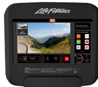
DISCOVER SE3 CONSOLE