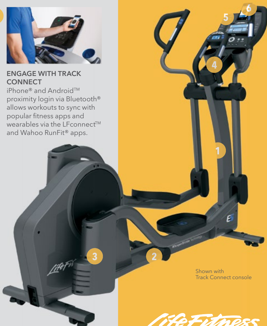
Shown with Track Connect console